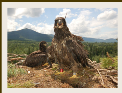
Bald Eagle Eaglets at Flagstaff